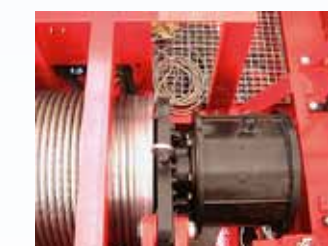
Permanent magnet motors