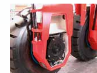
Permanent magnet wheel motors