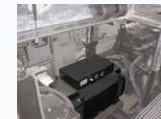
Permanent magnet generators